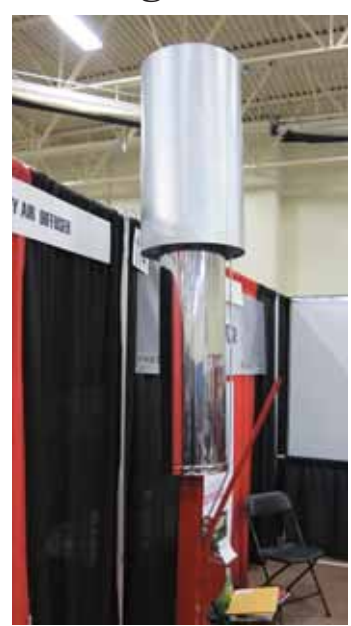
Chimney "diffuser" knocks down the wind velocity at top of chimney by introducing outside air at top of flue.

"When the diffuser is up at its maximum height it's about 15 in. higher than the stove's chimney. The diffuser's opening is about 3 times larger than the chimney, so the chimney is forced to draw most of its air from around