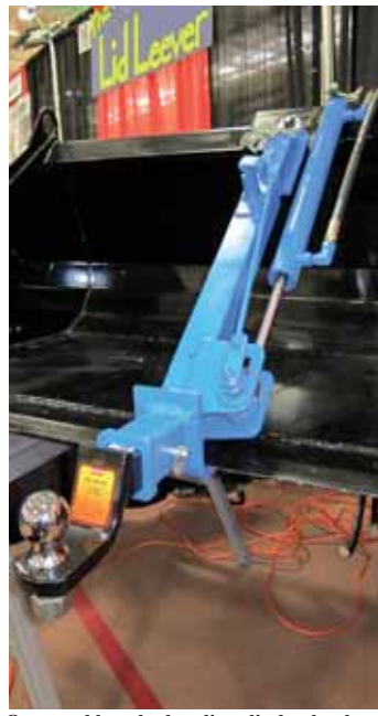
Operated by a hydraulic cylinder, bucketmounted hitch swings down 90 degrees and locks onto bucket's cutting edge.

minor fabrication changes to the bucket or the hitch system mount," notes Maas.