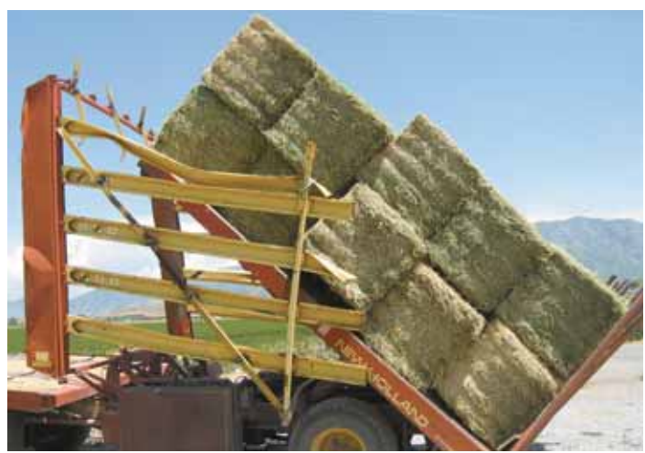
Garry Brown modified his self-propelled small bale stacker wagon to haul and stack up to 10 big square bales at a time.