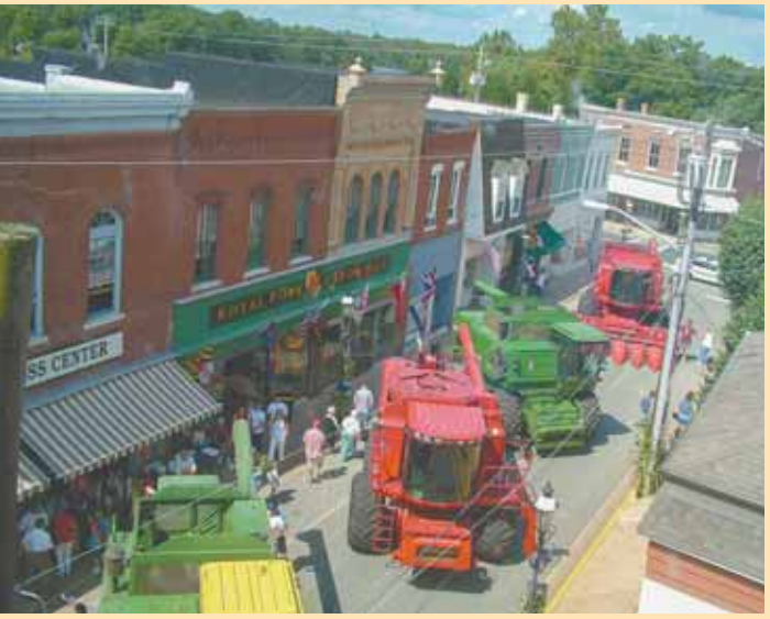
For years folks in Snow Hill, Md., have hosted a "Blessing of the Combines". The event draws a big crowd and has become an annual tradition for locals and city folks from nearby states.