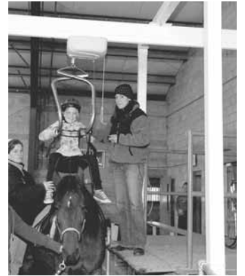
Lift system uses specialized slings that takes the rider right from a wheelchair to the horse.

Contact: FARM SHOW Followup, SureHands Lift & Care Systems, 982 County Route 1, Pine Island, N.Y. 10969 (ph 800 724-5305; info@surehands.com; www.surehands. com).