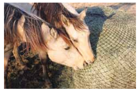
Having to pull hay through holes in net keeps horses eating more slowly.

Cinch Nets are made in house—in the USA!