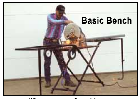
The new way of working.