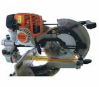
Kit lets you use a lightweight weedeater motor to power DeWalt chopsaws.

The turn-around time for the saw conversion is usually 2 weeks. "You can buy a saw at a local Stihl dealer and send it to us, or you can buy one from a Stihl dealer close to our manufacturing facility and we'll make the conversion before shipping the saw to you,"