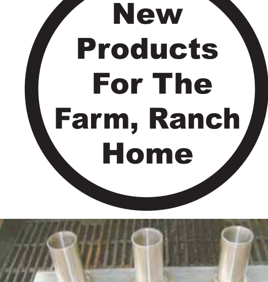
"Steamer Stand" lets you cook 3 chickens at a time over tubes partially filled with apple juice or beer.