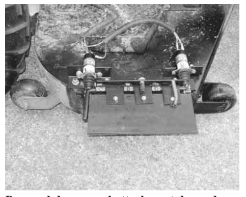
Powered drop-panel attachment drops down quickly to cover mower's chute opening at the touch of a button. Photo shows panel in the open position.

"It will close in half a second, no matter how much grass is coming out," he says. "The two solenoids have a total pull of about 60 lbs."