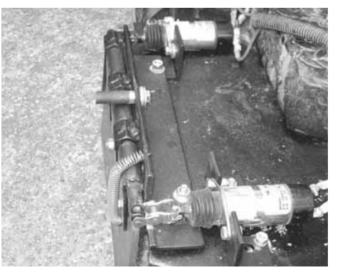
"We use 2 solenoids to close the panel and a spring to open it when the solenoids are turned off," says inventor Logan Goldschmidt.

"I wanted the hinge really strong and the panel weak," he says. "If the operator drives into something with the panel extended, it will give. The hinge and other components