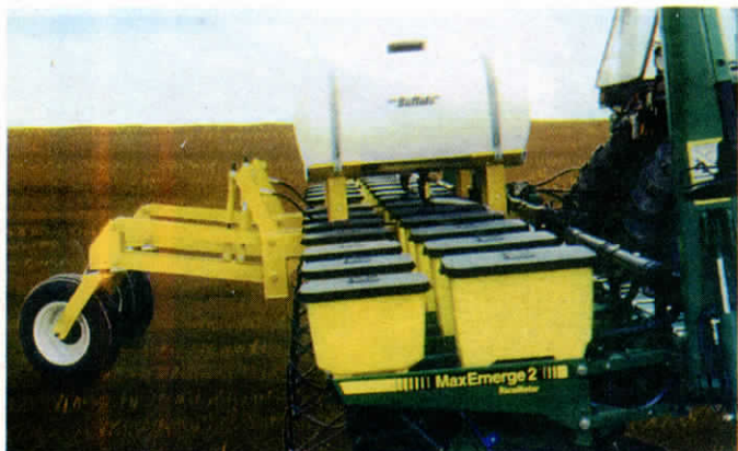
Fleischer Mfg. is selling its Buffalo lift assist wheels to fit Max-Emerge planters.