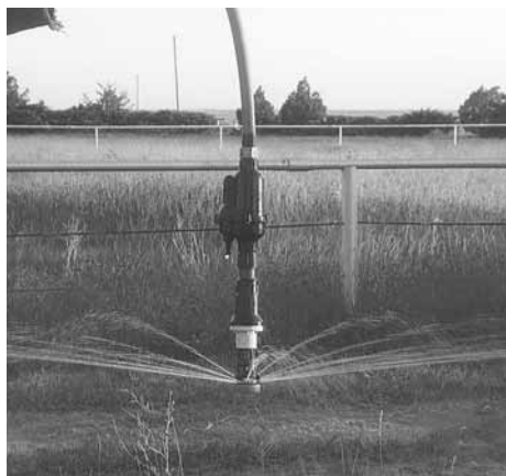
Filter fits between the hose and the regulator on center pivot drop nozzles (left). To flush out sediment you just push up a small release valve on side of filter.

“Just push up the small release valve on the side of the filter,” says Beer. “The water pressure will quickly flush out the sediment.”