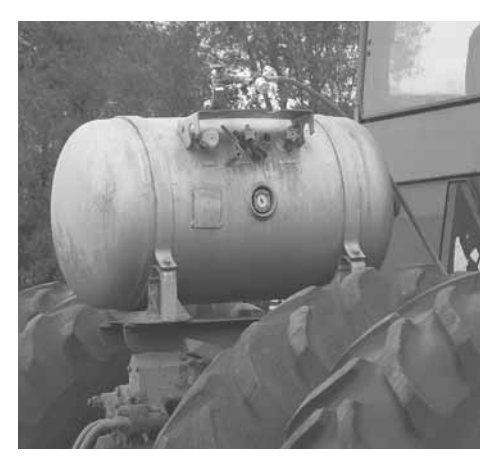
Propane Enhancer injects a little propane into diesel engines for faster speeds, more power, and a cleaner burn in tractors and trucks.

He says the propane simply helps burn diesel fuel more efficiently. Typically, he explains, only about 75 percent of diesel used is burned. With the propane injected, efficiency jumps to 98 percent.