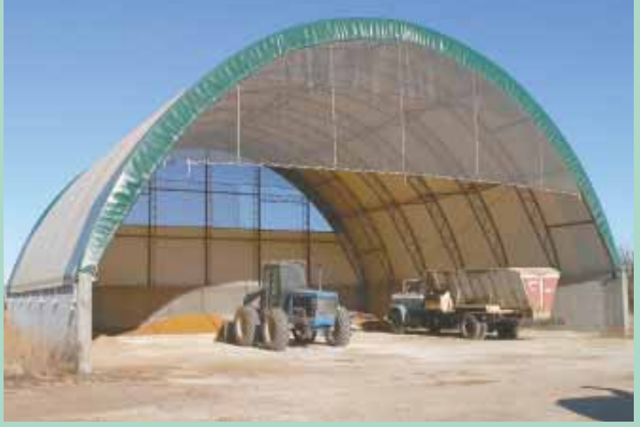
Silver Stream hoop buildings are used for livestock, equipment storage, temporary grain storage, and many other uses. A full line of end kits and doors are available.