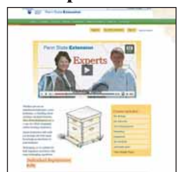
Penn State University offers an entry-level Beekeeping 101 course online.

There are 10 sessions in all with a self-assessment at the end of each