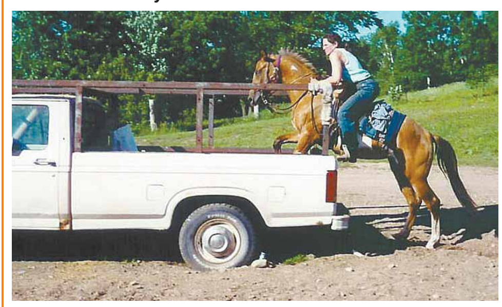
Newly trained horse climbs into pickup.

The only school of its kind in the world!!