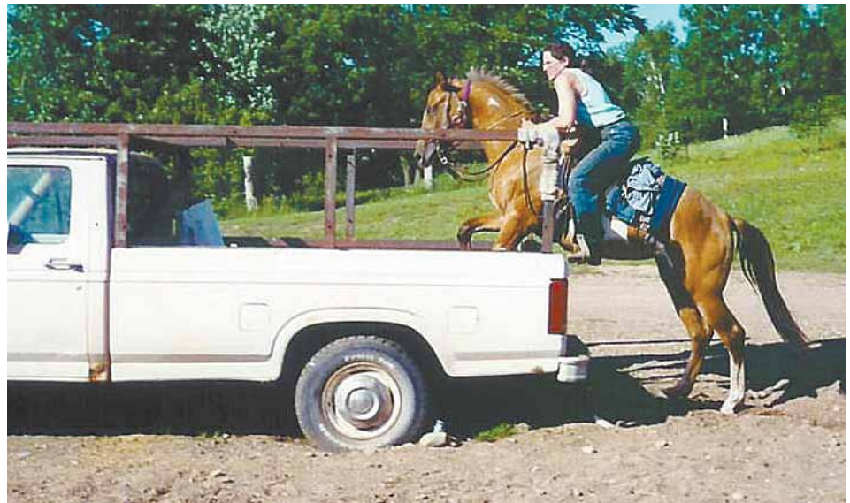
Newly trained horse climbs into pickup.

The only school of its kind in the world!!