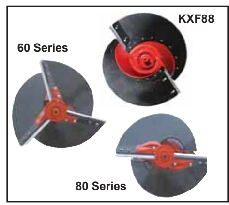
Bolt-on rotor flights are said to dramatically improve threshing performance. They replace OEM impellers on IH and Case IH combines.

Flights are used in harvesting all crops