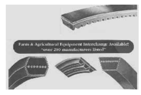
Combine drive belts are available, along with nearly every other type of V-belt for farm and ag machinery.