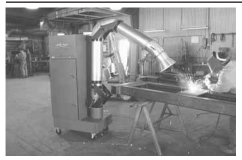
Air cleaner rides on four caster wheels. Suction arm on front draws dirty air into the unit before it has a chance to get out into shop.