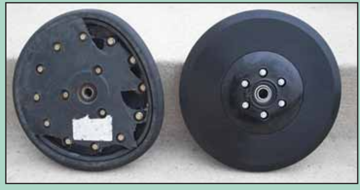
Collapsed closing wheel, left, is replaced by May Wes wheel, right.