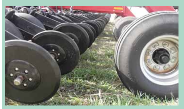
One South Dakota customer seeds 4,000 plus acres every spring. He used to replace up to 10 closing wheels per day. With the help of May Wes, he replaced all the original OEM wheels with the new May Wes UHMW solid closing wheels.

May Wes has a history of finding innovative solutions to help farmers solve problems in the field. The company has a long-running solid UHMW replacement closing wheel for no-till drills such as the Case IH SDX30 and SDX40.