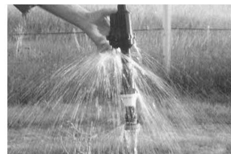
Filter fits between the hose and the regulator on center pivot drop nozzles (left). To flush out sediment you just push up a small release valve on side of filter.

on the side of the filter," says Beer. "The water pressure will quickly flush out the sediment."