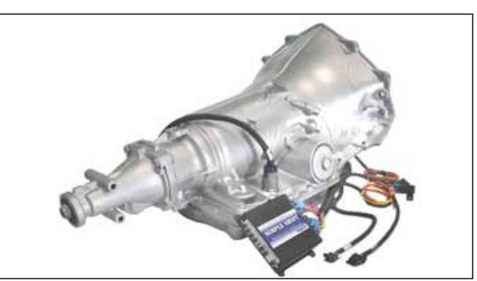
Simple Shift Transmission Controller lets an electronic overdrive shift smoothly whether it's under load or not, at lower rpm's and with better fuel efficiency.

Contact: FARM SHOW Followup, Auto World, 9th St. and 6th Ave. N., Great Falls, Mont. 59401 (ph 406 727-8915; autoworld@ bresnan.net; www.autoworldmt.com).