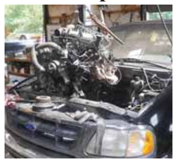
Truman Miller repowered a 1997 Ford F-150 with a 5-cyl. Deutz diesel engine that he bought on Craigslist for $1,500.

Miller adapted the exhaust with a 3-in. flexible pipe and used existing lines for the tachometer, the heater and AC connections. He rigged a new mount for the power steering pump and the alternator and bought a new V belt to run it because the Ford had