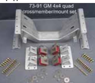
The company sells crossmembers designed to fit older Chevrolets as well as older GM and Ford trucks.