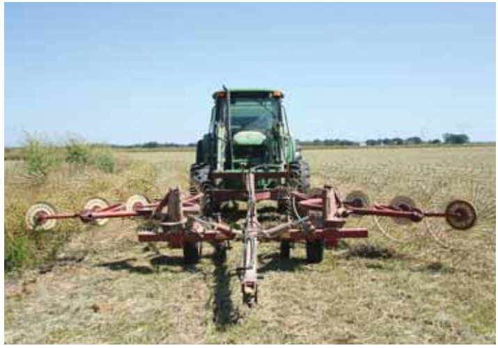
When his wife is available to help, she hooks rake up behind another tractor.