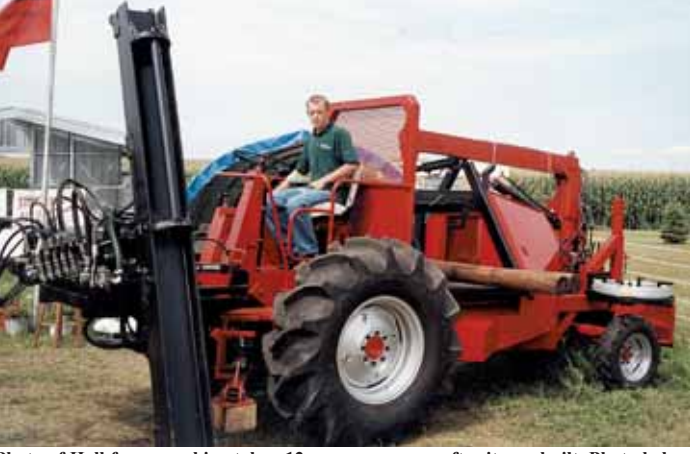
Photo of Hall fence machine taken 12 years ago, soon after it was built. Photo below shows machine as it looks today.

In addition to pulling and pounding posts,