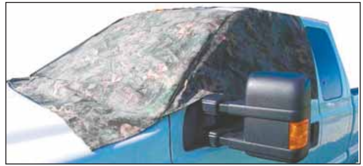
Windshield protector's side wings have pockets that slide over the doors' window frames and are locked in place when the doors are shut.

The windshield cover comes in camouflage