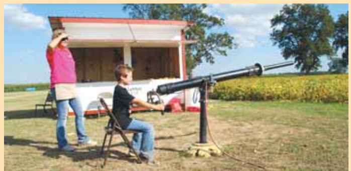
An air-powered corn cannon is just one of the activities for visitors at Peebles Farm. Operator holds onto a set of handlebars as he presses a button to fire.

He has also used golf balls in the cannon, which are more accurate. But corn fits in with the farm theme – and the Peebles have plenty of corn. The cannon has been used for eight years, and Peebles tore it down once to learn how it works. He has replaced some parts and