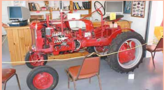
Rare Cub Cutaway was originally used by IH as an educational tool. An electric motor on the tractor ran all the components so you could see how everything worked.