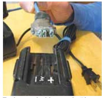
To charge a dead battery, the "dummy battery" is wired with a plug that plugs into the battery to be charged.

make them work. No matter what brand they