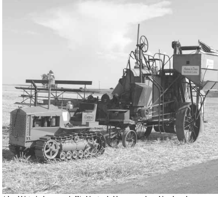
A local historical museum in Washington holds an annual combine day where you can see antique harvesters at work. Shown here is a 1936 McCormick Deering pulled by a Cletrac tractor.

For those wishing to see the field days, they are always held the last Saturday and Sunday