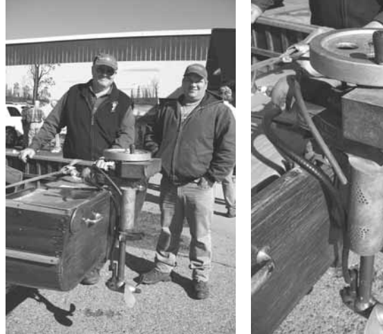
Collecting antique outboard motors is a relatively cheap hobby to get into, say members of the Antique Outboard Motor Club. Pictured here is a 1912 Evinrude.

Contact: FARM SHOW Followup, Lincoln County Historical Museum, PO. Box 585, 600 7<sup>th</sup> St., Davenport, Wash. 99122 (ph 509 725-6711); or Crayton C. Guhlke, P.O. Box 1272, Davenport, Wash. 99122 (ph 509 721-0130; crayton@centurytel.net).