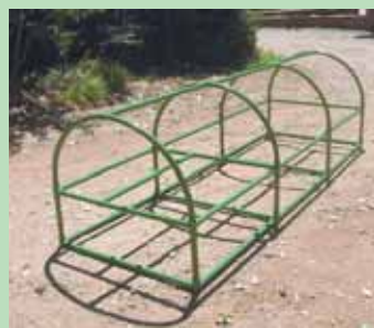
Unique fittings include arches and adjustable joints in both 3-way and 4-way styles.

The company only sells fittings by the box (suggested retail price) or case (wholesale price). Individual orders are referred to retailers including Amazon, Johnny's Selected Seeds, Lee Valley Tools and others. "Our fittings are indispensable when