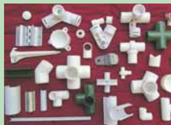
The company sells 300 different fitting sizes and styles.

building a structure with pvc pipe," says Ramey. "The ingenuity is just incredible when people have the tools to be creative."