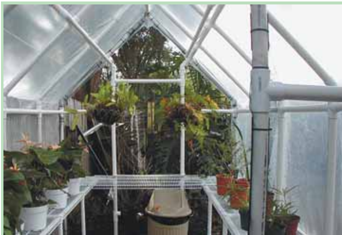
The interior of this greenhouse was made with pvc pipe and fittings from Circo Innovations.