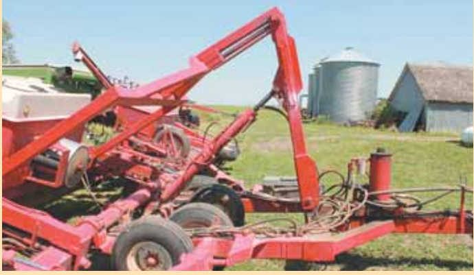
A 3-section frame built out of 7 by 7-in. sq. tubing supports both the rollers and planter units.

Contact: FARM SHOW Followup, John S. Stoltzfus, 3841 Brush Valley Rd., Spring Mills, Penn. 16875.