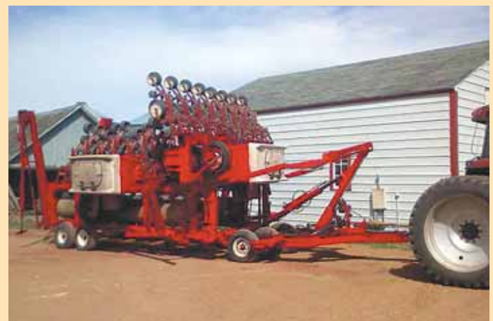
Folding the wings into transport position causes planter units to raise into a vertical

and then back against the side of the pave and plant. He used wing mounts from an old cultivator for the final fold.