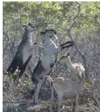
In one research trial, mob grazing goats created an effective firebreak. When a fire came through, it came up to the area where the goats had grazed and stopped.

As good as goats are for reducing fire danger, she has found them difficult to control