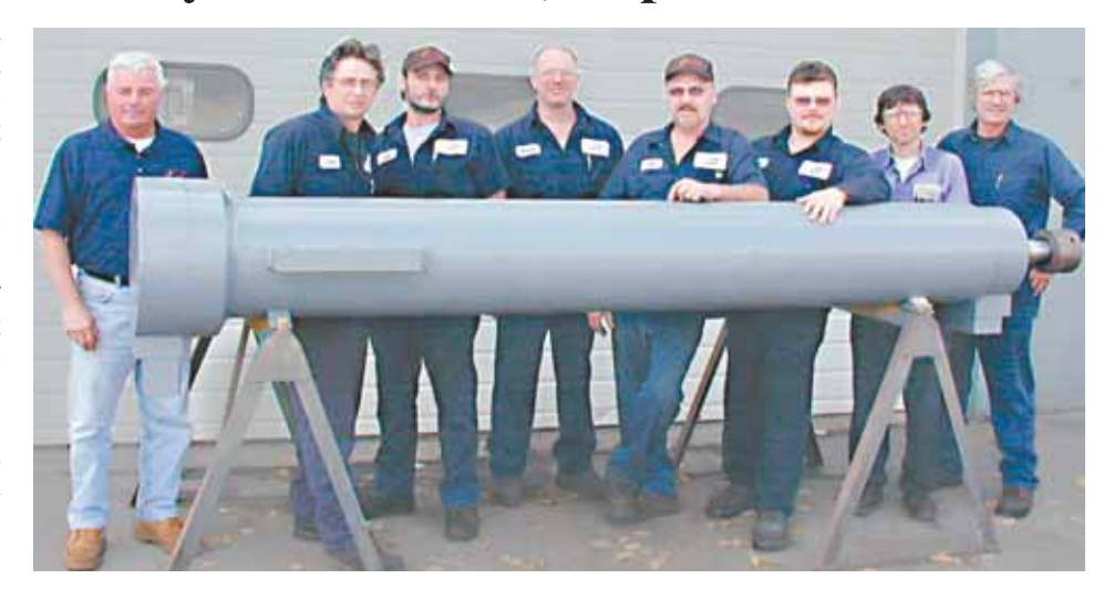
Cylinder Services, Inc., says it rebuilds everything from the smallest diameter cylinders to huge industrial cylinders measuring up to 24 in. in diameter. Their state-of-the-art shop can take on almost any hydraulic job.

They are a stocking Master Distributor of Prince Hydraulics and carry components from many other manufacturers too. Cylinders, pumps, valves, motors - you name it, they carry it, and they'll help you choose the part you need for your application. They also stock hydraulic fittings, gauges, meters, and accessories for hydraulic systems.