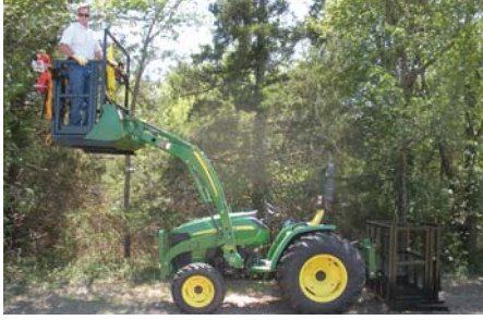
Bucket basket" straps into front-end loader bucket to provide a safe work platform. It can hold 1 or 2 people.

Contact: FARM SHOW Followup, Level Rite Ladder Safety Tools, 3120 Foothill Blvd., Oroville, Calif. 95966 (ph 530 534-6000; www.levelrite.net).