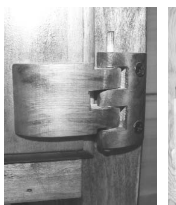
Wood door has an ash wood latch and poplar hinge that rides on a dowel.

One of his recent projects is a wood door with a wooden latch and hinges. He calls it his "bear-proof door" because he's fairly certain it could withstand the assault of a bear scouting for the source of sunflower seeds that fill the bird feeder hanging in