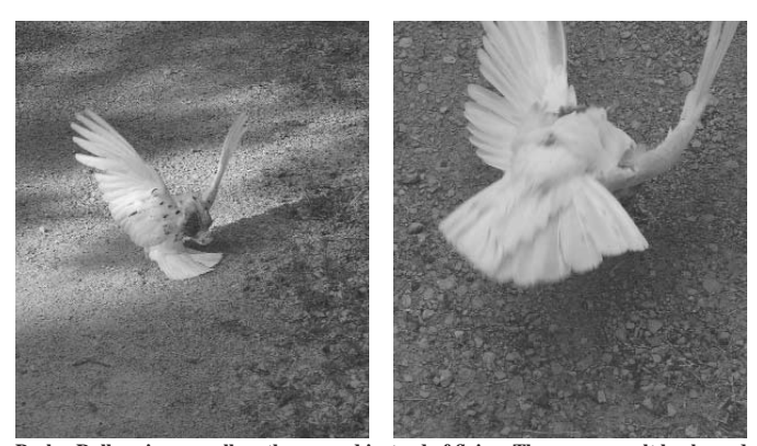
Parlor Roller pigeons roll on the ground instead of flying. They somersault backward across the ground, rolling hundreds of feet.

The Parlor Roller breed is different from another performing breed called Roller Pigeons developed in the 1700's in