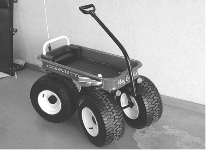
Radio Flyer wagon rides on big garden tractor tires and has a padded vinyl seat and rollbar on back. Note side-by-side Corvette C-5 exhaust mufflers.

Contact: FARM SHOW Followup, Doug Schiller, 345 Beister Drive, Belvidere, Ill. 61008 (ph 815 979-4591; flagcaddie@gmail. com).