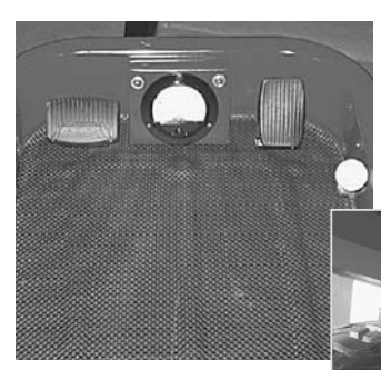
pedals, a fake speedometer gauge, and white ball shifter knob.