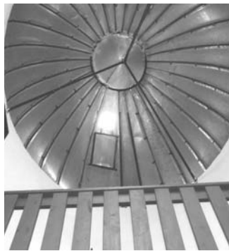
This view from top level looks straight up into silo roof.

Each level offers something different. The lowest level has a hot tub. The second has swings hanging from the ceiling, which Sue's daycare kids like to swing on. Made of chains