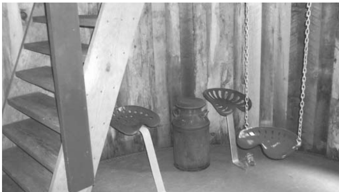
Because of the silo's small diameter, the 25-degree, ladder-like stairs between floors are very steep.