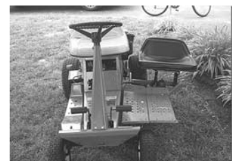
Home-built "sidecar" mounts on left side of an old Deere riding mower and rides on a single caster wheel.

The caster wheel mounts on a spindle off an old riding mower. A pair of footrests