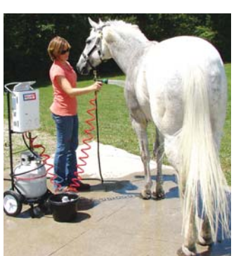
Insta-Hot portable hot water shower hooks directly to a water supply and heats up within seconds.

"Many of our customers are show horse people," Pinnell says. "And this unit is becoming popular with 4-H programs and