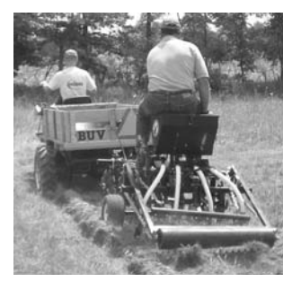
Equipped with tillage attachments, BUV's can be used to till, plant and cultivate gardens and fields.