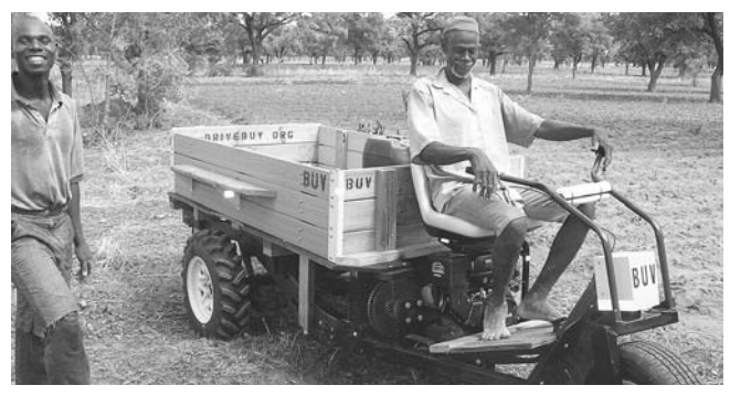
The Basic Utility Vehicle, or BUV, is a low-cost ATV without all the bells and whistles. It can be fitted with tractor-style tires for farming and logging.

The low-cost machines also can be used to haul kids to school or take people to clinics.