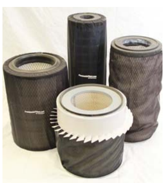
Pre-filters are made from a polyester mesh that protects air filters fromlarger trash particles and also repels water.

they open the canister, they find dirt piled up below the pre-filter, and the filter inside is still clean," says Orlowski. "One farmer told me he saved $180 by not having to replace one air filter."