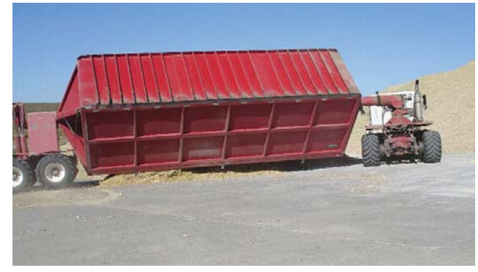
Lowell Weitzenkamp needed a big side dump trailer strong enough to handle anything from ear corn silage to composted manure. He came up with a new side dump design.

Contact: FARM SHOW Followup, Lowell Weitzenkamp, 1870 Co. Rd. B. Uehling, Neb. 68063 (402 567-2285; lowmarw@