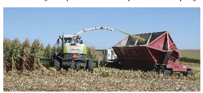
Trailer box measures 8 by 8 ft. by 34 ft. long. Hinges allow trailer driver to tip box toward chopper while loading.

Lyons, Neb. 68038 (ph 402 687-2655; toll