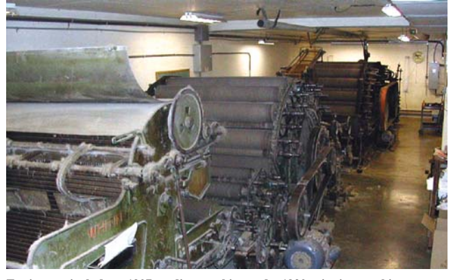
Equipment includes a 1907 carding machine and a 1920 spinning machine.

Contact: FARM SHOW Followup, Ohio Valley Natural Fibers, 8541 Louderback Rd., Sardinia, Ohio 45171 (ph 937 446-3045; www.ovnf.com).