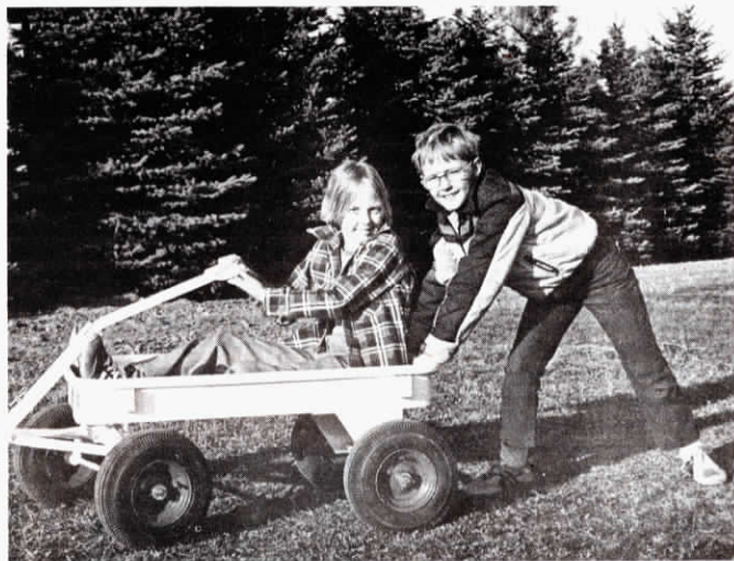
Mosdal wagon is built extra heavy to handle loads up to 1,000 lbs.

In addition to being an "indestructible" toy, the heavy duty wagon is