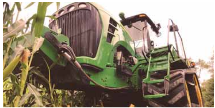
A 1 1/4-in. dia. steel cable hangs on bracket at front of tractor. To pull out the stuck tractor, you hook up to cable on front.

Contact: FARM SHOW Followup, Ben Brutlag, 30488 Landmark Rd., Brooten, Minn. 56316 (ph 218 731-2117 or 320 808-1462; Ben@Easy-Out.com; www.Easy-Out.com).