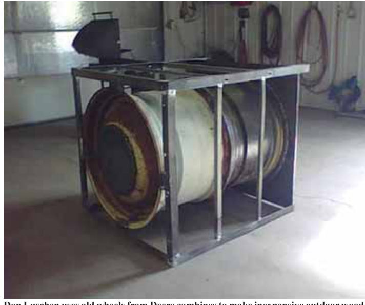
Don Luschen uses old wheels from Deere combines to make inexpensive outdoor wood burning stoves.

Contact: FARM SHOW Followup, Don Luschen, 57805 855 Rd., Wayne, Neb. 68787 (ph 402 369-2543).