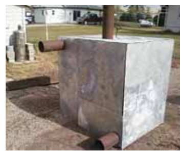
A 22-in. dia. door is cut into one end of stove for loading wood. A heat duct and cold air return are on back.