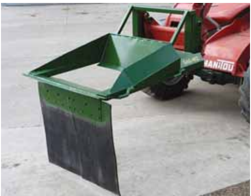
Loader-mounted bagger digs into pile of firewood. Operator then flips unit back and tosses wood into bag until it's full. Heavy-duty rubber flap protects front side of bag while loading.