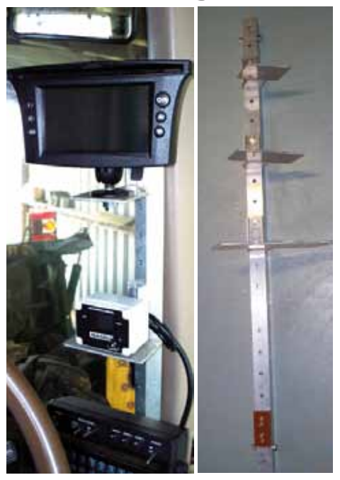
Mounting tree holds 3 or more monitors in one location, and is easy to see and operate from tractor seat.

The mounting tree, which comes with 2 shelves and the power connector, sells for $325 plus tax (where applicable) and S&H. Additional shelves sell for $45 apiece. The adaptor bracket sells for $25 plus S&H.