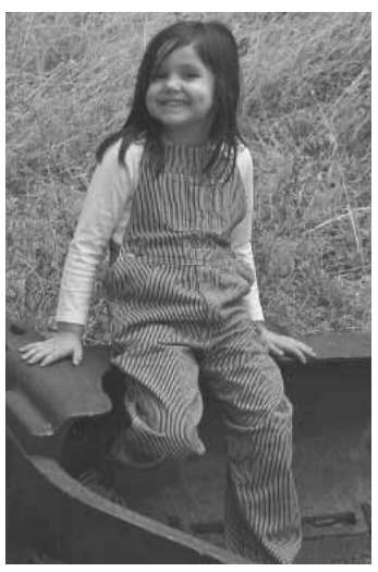
sells a variety of overalls to fit men, women and children.

Besides the online store, Hearron will mail a free catalog. Contact: FARM SHOW Followup, MHOVERALLS, P.O. Box 21, Scurry, Texas 75158 (ph 866 218-0179).