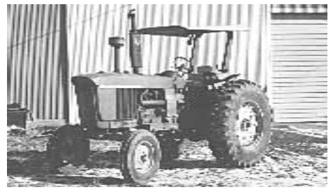
Permanent replacement seals don't leak like factory seals, says Boling Machine.

We also sell load control shafts for most models. New seals this year are, 2950, 2940, 2840, 2850, 2855, 2550 and many others. All seals are fully guaranteed.