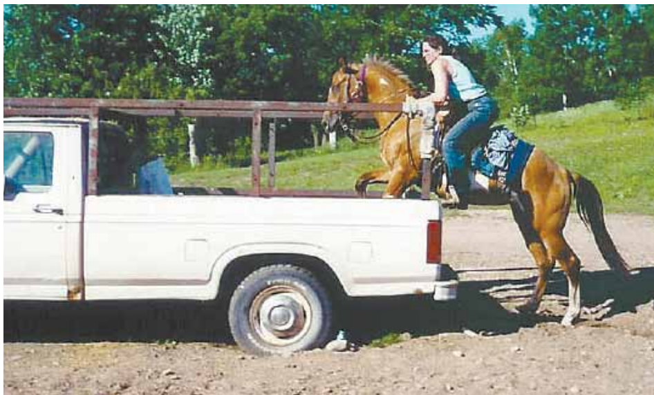
Newly trained horse climbs into pickup.

The only school of its kind in the world!!