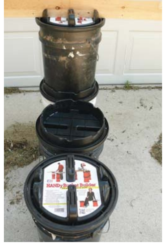
Hard plastic tops fit any standard 5-gal. bucket and, along with 2 by 4 studs, can be used to set up a work bench instantly.

HBB tops are available from a growing list