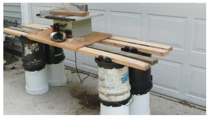
Tabs in the molded plastic tops hold 2 by 4's in place.