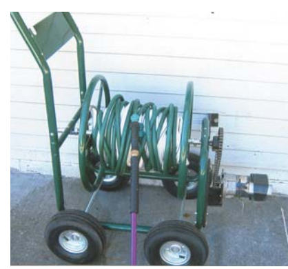
Hall's 4-wheeled steel hose reel is chain-driven by add-on gear reduction motor.