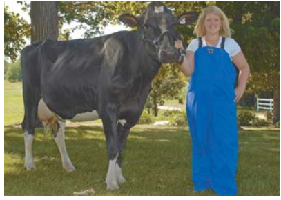
Waterproof overalls can be washed and dried like

In 1994, she made a towel tote for herself to regular clothing.