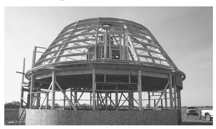
He built the structure like a pole barn, starting with a center point and a 20-ft. board to mark where to place the laminated 2 by 6 posts for the 40-ft. dia. building.

CAD template as a pattern to cut the curves on the horizontal boards to create a round shape. Drawing the plans and shingling were the most challenging parts of the barn, which also includes a rectangular entry, or "doghouse" – a common design on old barns in