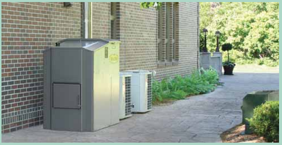
The Maxim is more than 95% efficient. It adapts easily to most new and existing heating systems like forced air, radiant floor or baseboard, and existing boilers. It can even provide all your domestic hot water.

Rotating Aerator (Patent Pending): Located in the center of the burn chamber, the aerator is submerged in the fuel bed and supplies oxygen to the fuel for the most complete combustion, allowing the M250 to achieve efficiencies over 95%.