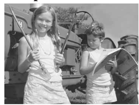
Jensales has more than 16,000 service manuals available for tractors, implements, and all kinds of heavy equipment.

You can search the catalog and check out the free research tools on the Jensales web-