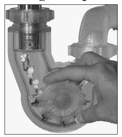
Knob on side of trap quickly clears clogged drain and helps retrieve jewelry.

Ahuja gave FARM SHOW a sample to try. Installation was easy, and it seems to work