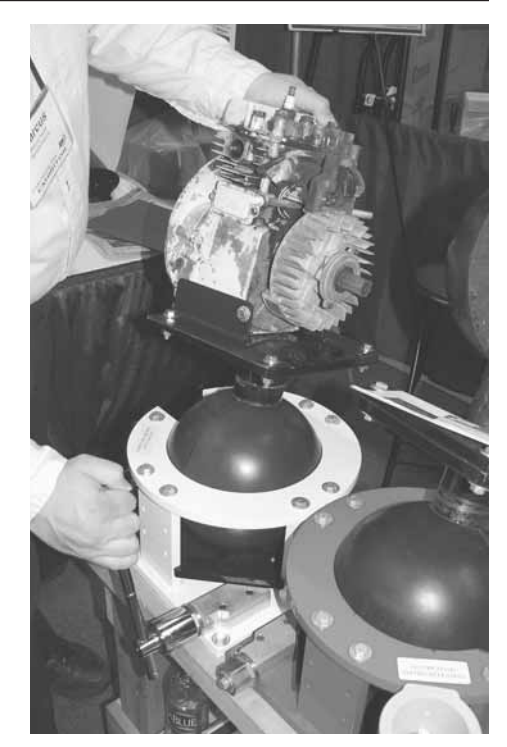
Vise design allows you to work on all sides of an object without having to reclamp.

Contact: FARM SHOW Followup, Semmel Enterprises, Inc., 3268 South 31st St., Lincoln, Neb. 68502 (ph 402 730-4590; semmelentvp@aol.com; www.monsterball vise.com).